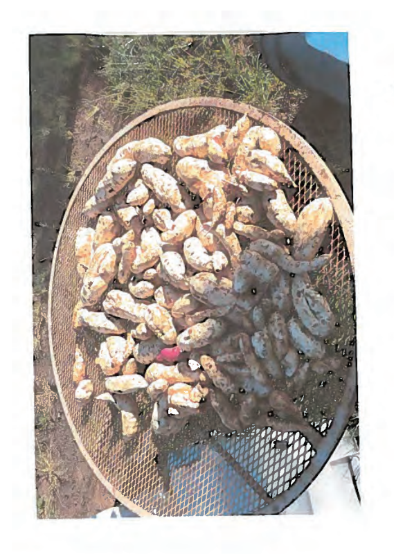
Harvested sweet potato used in many different ways of cooking.