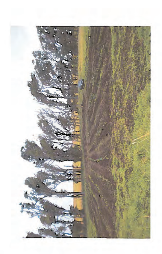
Paul Makuakane 2 acre taro and sweet potato farm.